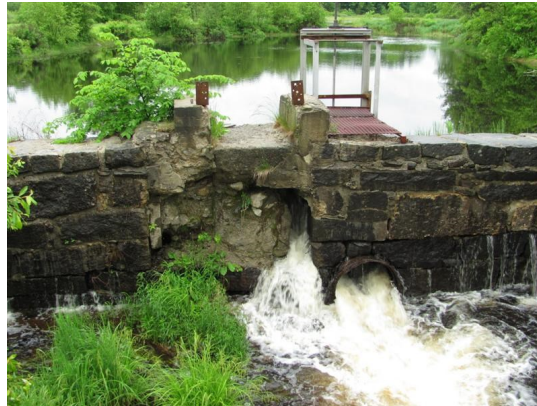
View of the Clary Lake Dam

Approximately 70 Whitefield citizens and several from Jefferson attended a Town Meeting held on May 30 th to discuss a proposal to proceed with negotiations to acquire the Clary Lake dam.