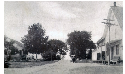
Downtown North Whitefield