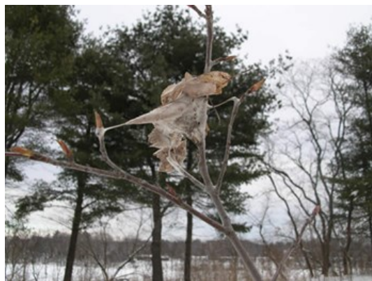
Browntail Moth web

Right now the caterpillars are snug in webs tightly wrapped in silk out at the very tips of oak and apple tree branches. This is where they will stay until the sun warms them in late April. At that point they emerge from their winter sleep and look for new tree leaves to eat. During May and June the caterpillars eat and grow and shed their skins (note this - shed their skins) four times before they become pupae and then transform into adult moths.