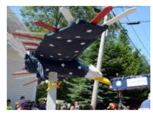
1st place: Burns family Free Bird float!