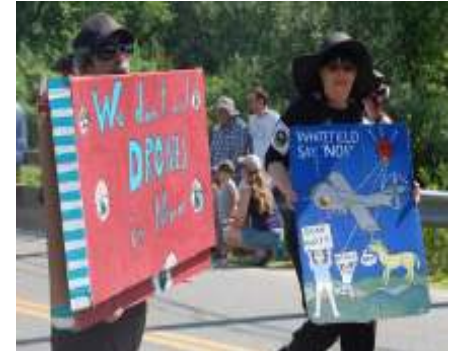
2nd place: No Drones in Maine!