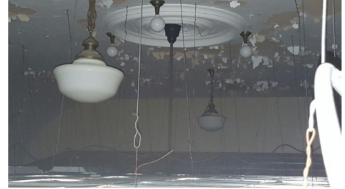
Above suspended ceiling in the grange