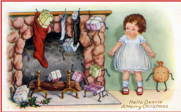
Postcard circa 1940.