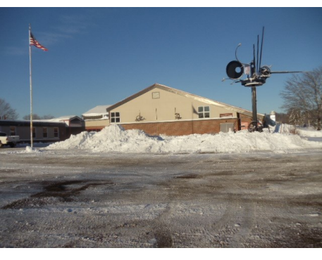
Whitefield School

Whitefield Elementary School held a community forum in order to collect information from the community about areas in which the school should work to improve. The forum generated many ideas and the school has embarked on a process to address the areas of improvement.