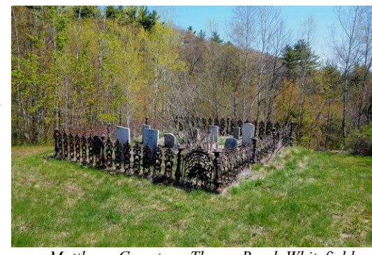
Matthews Cemetery, Thayer Road, Whitefield

are privately owned and maintained. The remaining twentytwo cemeteries are located in woods and fields on private property; except for Howe Cemetery in Coopers Mills