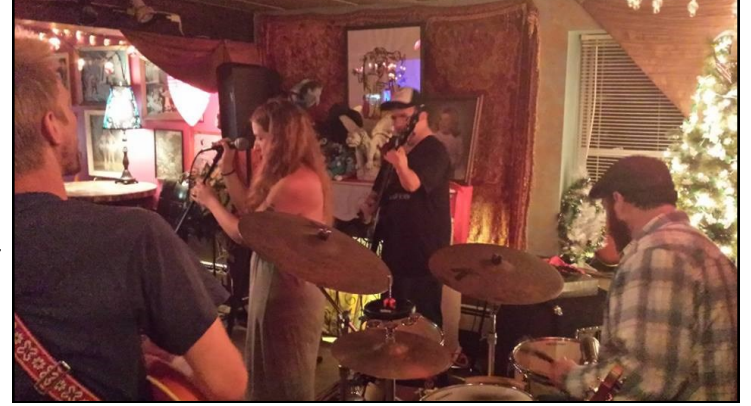
Two musical groups are scheduled to play Whitefield Days including "The

Two musical groups are scheduled to play under the