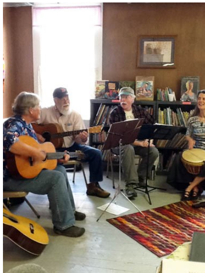
Well Seasoned