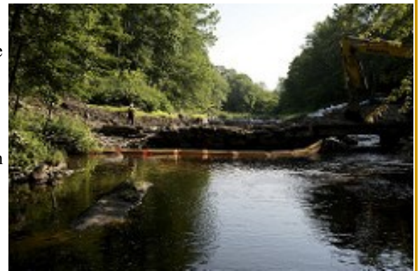
taken August 8th during dam removal process

The content of the sign has been compiled with collaboration between the Whitefield citizen committee and ASF.