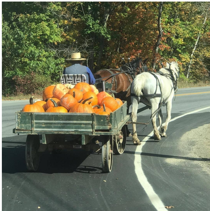
Reminder: slow down, drive with caution, and enjoy our Whitefield sights!