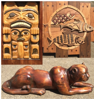
Tom Sweet - Art Show Sheepscoot General Store September 4 - 30, 2018

This show runs the full month of September at Sheepscoot General. On September 14 th come meet Tom from 4:00 – 6:00pm and stay for pizza and music.