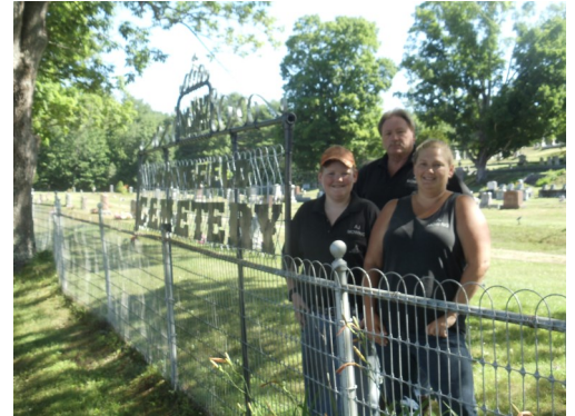
(photo and article courtesy Dan Joslyn, Whitefield Cemetery Corporation)

The Monteith's maintain the Whitfield Cemetery south of Kings Mills.