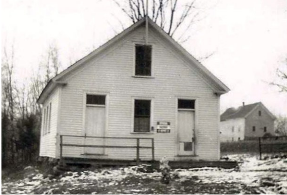
Historical Society Photo of Church School 1947

Did you attend one of Whitefield's one-room schools during the 1940s and 1950s? If so, you attended one of six schools: Coopers Mills, North Whitefield, Church, Keyes Corner, Kings Mills, or the Plains. You walked or rode in a private vehicle; later on you rode a bus. You brought your lunch box, and maybe helped lug wood for the wood stove or got a pail of water from a neighbor's well to pour into the water crock. Do you remember making cups out of arithmetic paper?