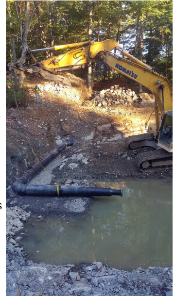
The dry hydrant intake installation in the upper pool before the trench was backfilled

Maranda Nemeth Midcoast Conservancy in partnership with Atlantic Salmon Federation & The Nature Conservancy