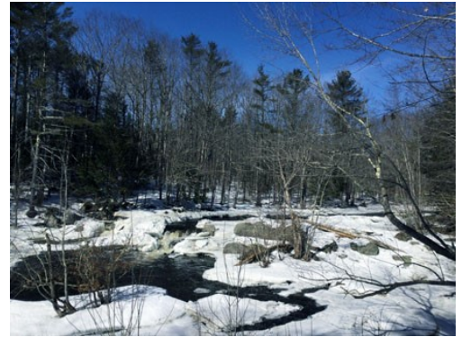
A March 2019 view upstream on the Sheepscot West Branch from the site of the old Howe Road Bridge