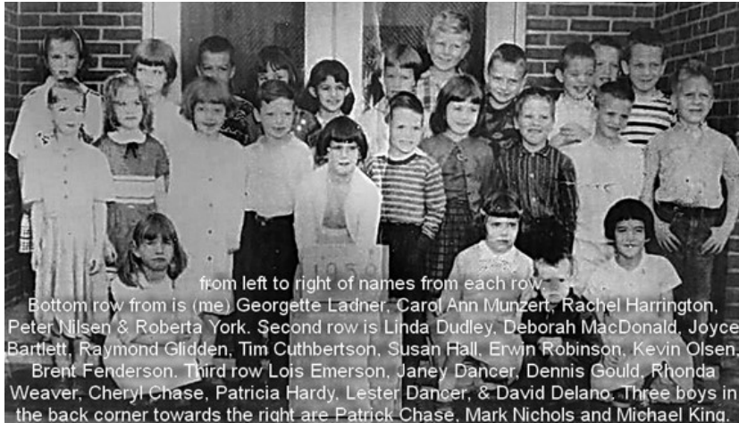
from left to right of names from each row