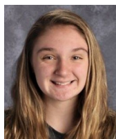
Kiley Lee Erskine Academy