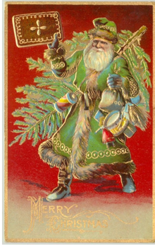
Post cards from Lillian Rogers Collection.