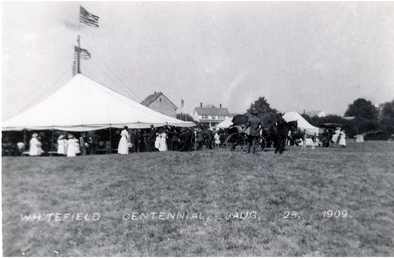
Whitefield Centennial Celebration, August 25, 1909